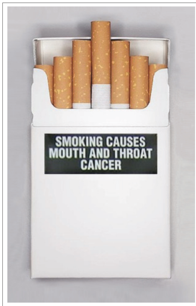
FIGURE 3: Text-based warning: Smoking causes mouth and throat cancer.

Research has shown that, when exposed to marketing stimuli, consumers exhibit a variety of different emotions that influence outcome variables such as behaviour (Shimp 2003). However, the literature on emotions still contains a number of caveats. The inadequacy of studies of consumers' emotional responses to marketing stimuli has been pointed out by several authors (Heath 2007; Zaltman 2003). Its measurement has been a particularly thorny issue (Bagozzi, Gopinath & Nyer 1999). Although attempts have been made to measure consumers' emotional responses, they have almost always used 'self-report' assessments from which to draw conclusions. In these studies, consumers are asked to indicate the degree to which they feel they experienced each emotion on an ordinal response scale such as a Likert or a semantic differential scale. This approach, often relying on introspection at a later stage or even memory and recall,