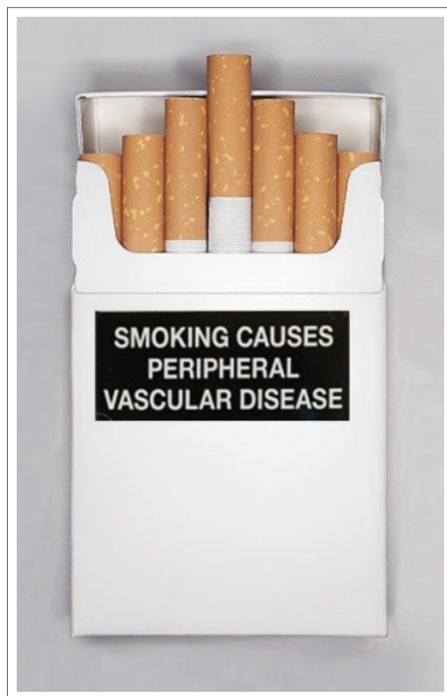
FIGURE 1: Text-based warning: Smoking causes peripheral vascular disease.

The stimuli used in this study were four anti-smoking, fear-based appeals that are typically found on cigarette packaging and consisted of two text-only warning messages (Figures 1 and 3) and two text and picture warning messages (Figures 2 and 4). For each text-only warning label a pictorial warning message (still including the original text-only warning message) was also used. The combination of text and visuals on one stimulus is consistent with previous studies (Kees et al. 2010:266; Vardavas et al. 2009:1).