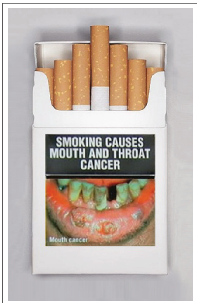
FIGURE 4: Both text and picture-based warning: A mouth with a tooth missing, several damaged teeth and cancerous sores on the lower lip.

respondent looks (gaze, or eye-fixation) directly with the subsequent arousal and attention (Wedel & Pieters 2000).