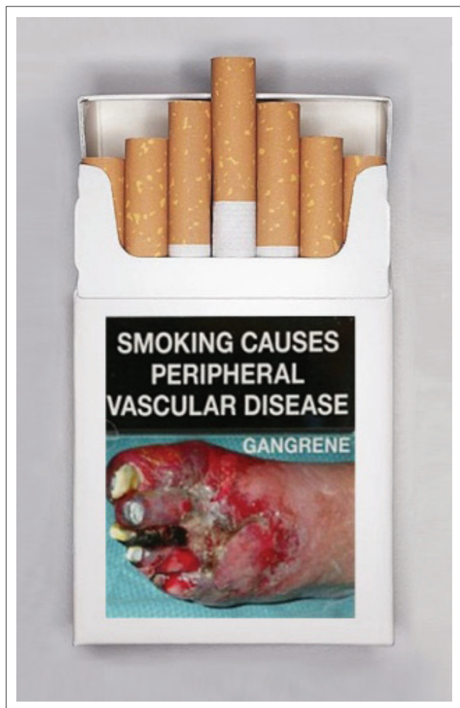
FIGURE 2: Both text and picture-based warning: A gangrene-affected foot.

When referring to results relating to picture stimuli, reference is therefore made to the combination of text and picture warning messages on the same packaging (see graphics in Figures 2 and 4).