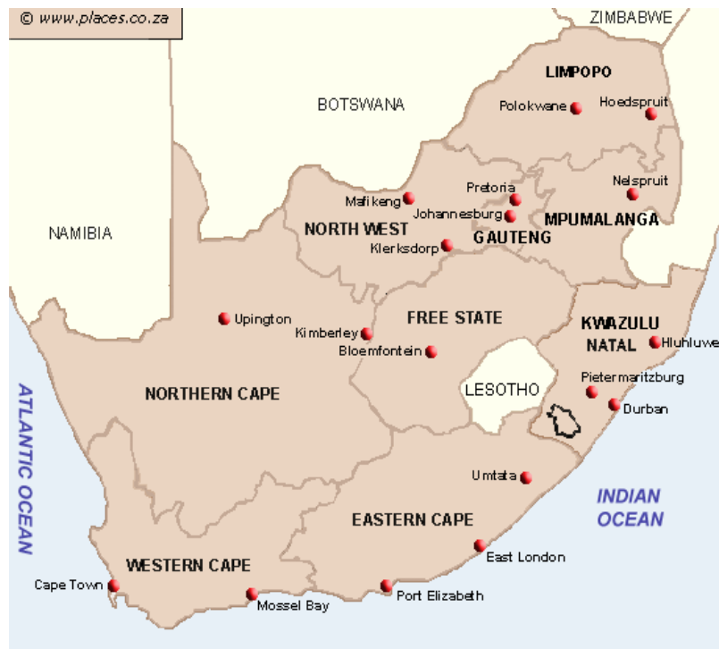
Figure 2 Provinces of South Africa

the Northern Cape and the Free State (see Figure 2). These are described in detail below.